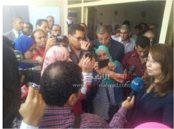
Minister Ghada Wali interviewed at Obour opening